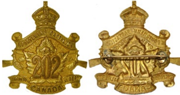
702-11-112 Cap Gilt finish. Pin fasteners. Not maker marked