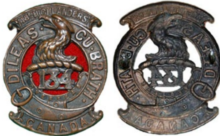
634-11-106 Cap Toronto' Brown finish. Round wire lug.s Maker marked 'P.W.Ellis & Co.