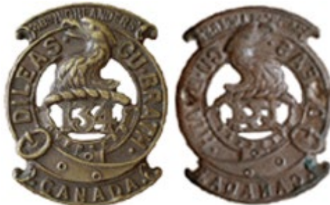
634-12-106 Collar Brown finish. Round wire lugs. Not maker marked