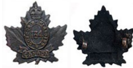
634-12-102 Collar 'Gordon Highlanders' 134th Bn. Smooth semi-hollow back with copper wire lugs.

The first badges were produced by P.W.Ellis and are maker marked 'P.W.Ellis & Co. Toronto'. This pattern has a large buckle and the numeral '134' is textured. The other ranks badges have flat cut sheet copper lug fasteners.