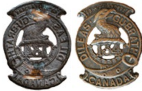
634-12-104 Collar Brown finish. N/S/ Flat cut sheet copper lugs.. Not maker marked